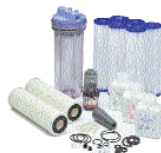
Preventative Maintenance Kit