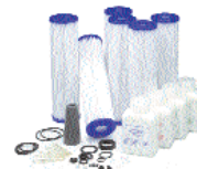
Extended Cruise Kit