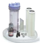
Silt Reduction Kit

For waters with high levels of suspended matter, e.g. in shallow anchorage, we would recommend you use an additional prefilter. This additional filter is finer (5 microns - 1 micron = 0.001 mm) than the standard filter (30 microns) and is placed after it. A booster water pump (12V/0.8 A/h) is also provided. This pump compensates for the loss through the second filter and increases water production. We would also recommend the prefilter kit when the Power Survivor is not installed under the water line and when it is in constant use to increase the intervals between servicing.